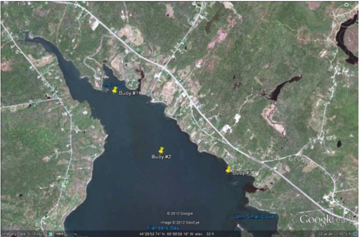
Flanders Bay showing harbor boundary markers